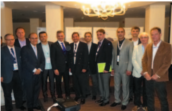
XIII Congress of the Serbian Association and II Conference of the Balkan Association, Nis, Serbia