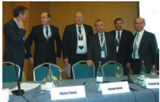
ICOMS, Barcelona October 2013